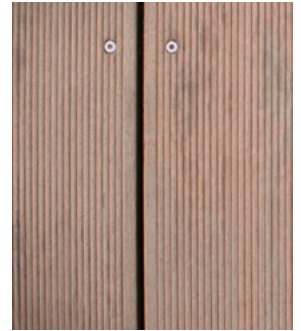
Application example: Dirty balcony boards before (left) and after treatment (right).