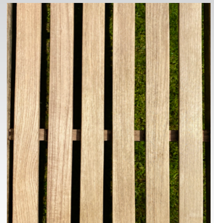
Wood bench cleaning: Before, during and after Arvox application.